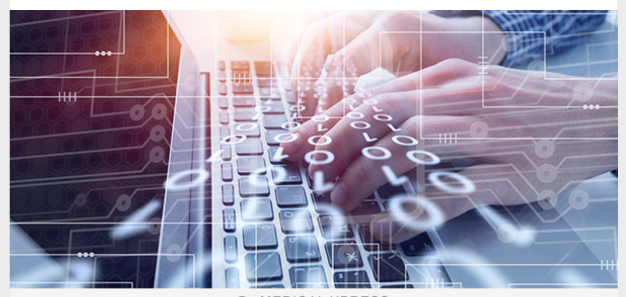
By MEDICAL XPRESS